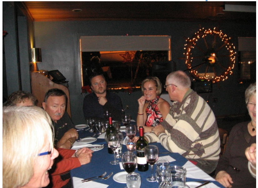
Members enjoying the Commodore's Charity Event